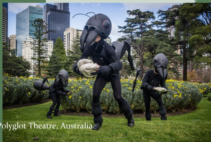
Ants, Polyglot Theatre, Australia

Order at 613-241-0999 or contact@ottawachildrensfestival.ca